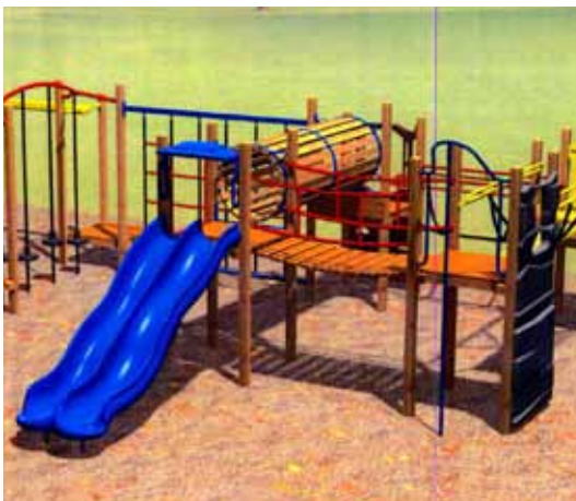
Proposed new playground